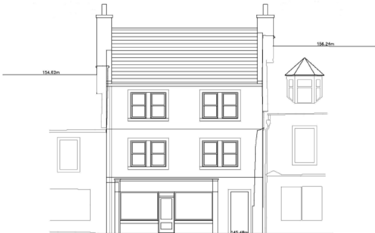
41-43 High Street, Innerleithen - NW Elevation